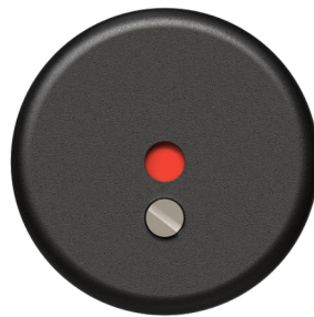
SEVERE DUTY POWDER-COATED HARDWARE