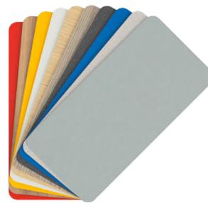
COLOUR SAMPLES AVAILABLE ON REQUEST